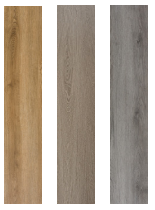
Coppin Oak Pearse Oak Barton Oak TIM416002ST25 TIM904601ST25 TIM256002ST25