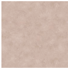
maya fawn* TAC27028047M2 | TAC27021047M3