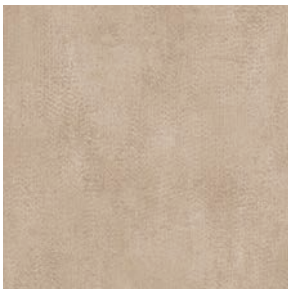
modern concrete smoked TAC5518159M2 | TAC5517159M3