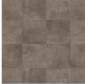
texture black* TAC27028046M2 | TAC27021046M3