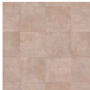
texture beige* TAC27028043M2 | TAC27021043M3