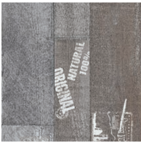
travel wood black TAC5518203M2 | TAC5517203M3