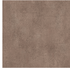
modern concrete brown TAC5518158M2 | TAC5517158M3