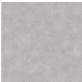
maya smoke* TAC27028048M2 | TAC27021048M3