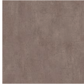
modern concrete black TAC5518157M2 | TAC5517157M3