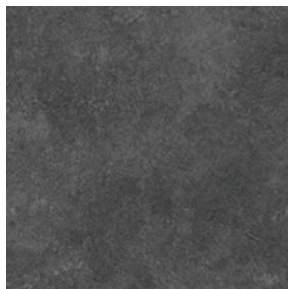
maya black* TAC27028035M2 | TAC27021035M3