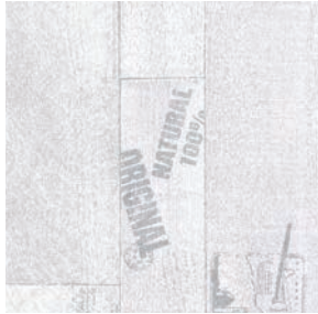
travel wood white TAC5518204M2 | TAC5517204M3