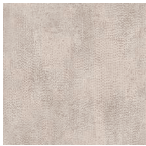
modern concrete grey TAC5518163M2 | TAC5517163M3