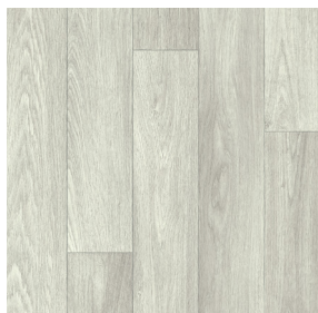
nimes 592 VFT10920592