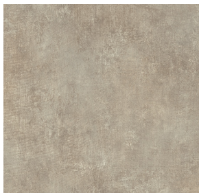
breen 581 VFT15020581