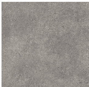
clara 594 VFT11820594