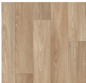
nimes 536 VFT10920536