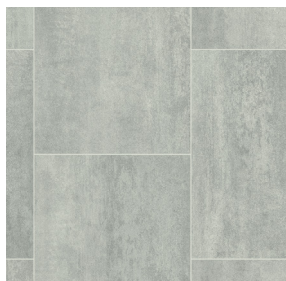
madrid 570 VFT12720570