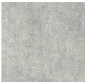
breen 573 VFT15020573