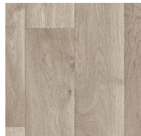
montreal 507 VFT10120507