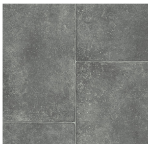
modica 595 VFT21420595