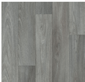
nimes 588 VFT10920588