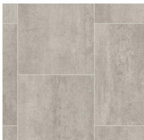
madrid 512 VFT12720512