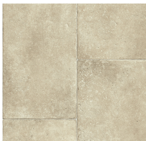
modica 532 VFT21420532