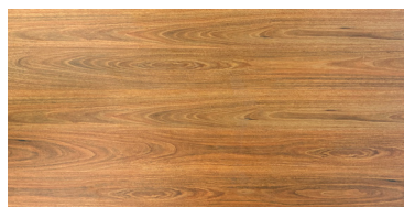
Healesville Spotted Gum NEXIS010