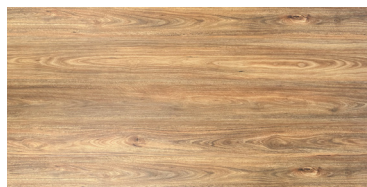
Albany Spotted Gum NEXIS006