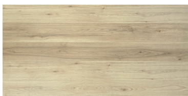
Karumba Oak NEXIS001