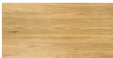
Trentham Blackbutt NEXIS003