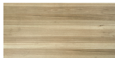
Launceston Blackbutt NEXIS004