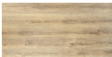
Wollombi Oak NEXIS002