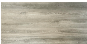
Lyndhurst Oak NEXIS009