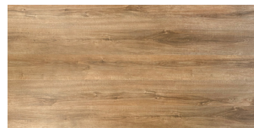
Tamworth Oak NEXIS008