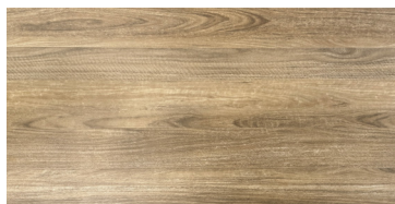
Mossman Spotted Gum NEXIS007