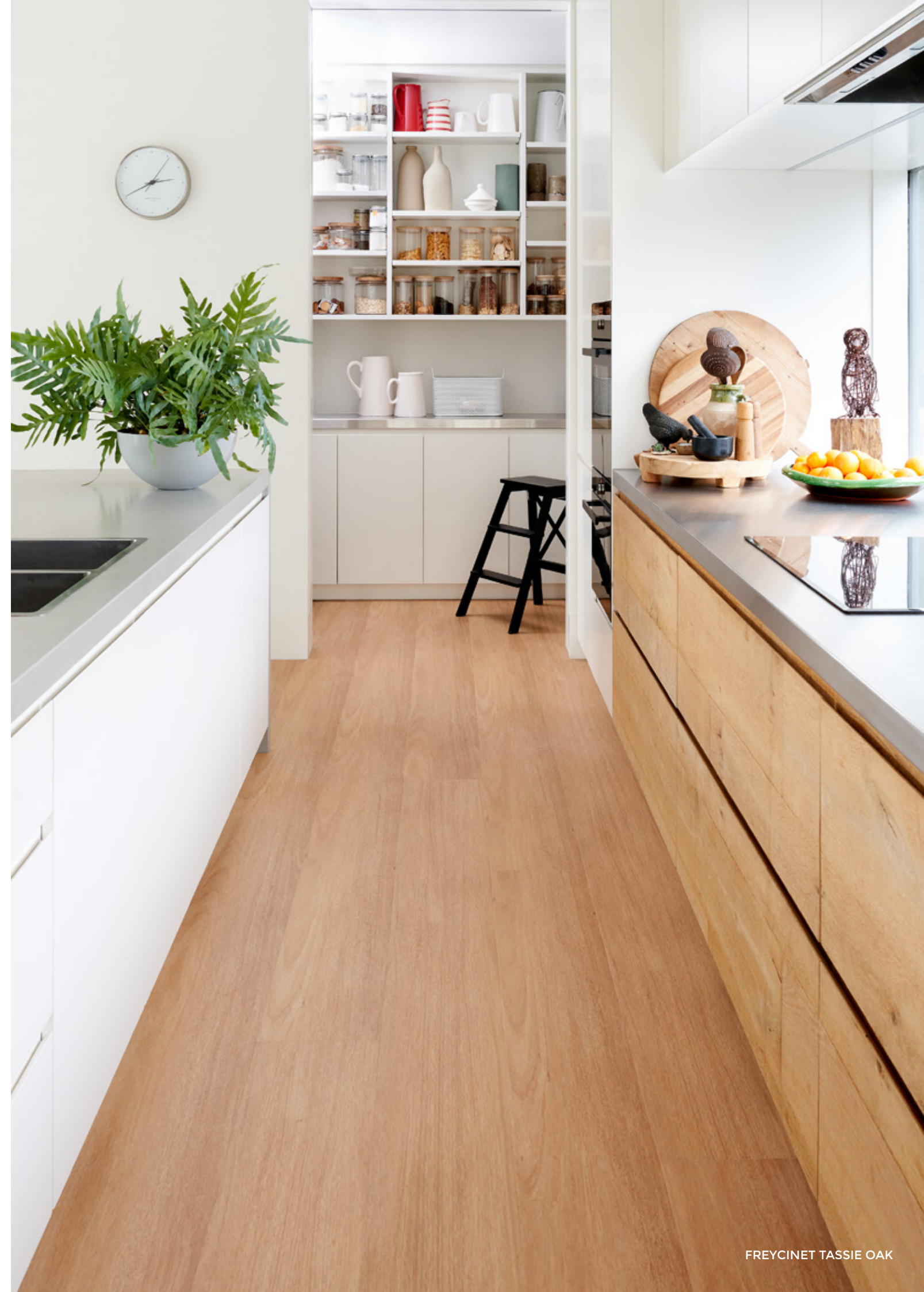
FREYCINET TASSIE OAK