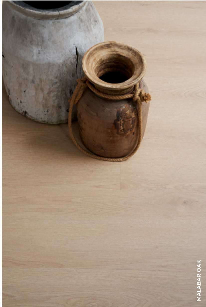
FRONT COVER: MALABAR OAK