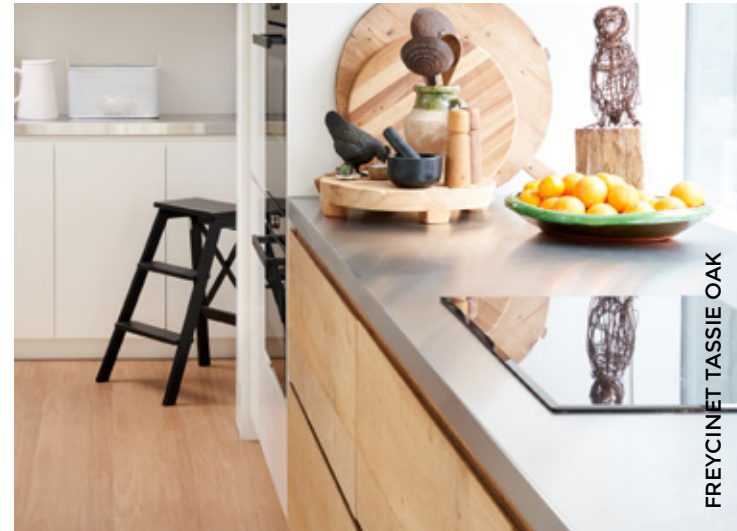
FREYCINET TASSIE OAK