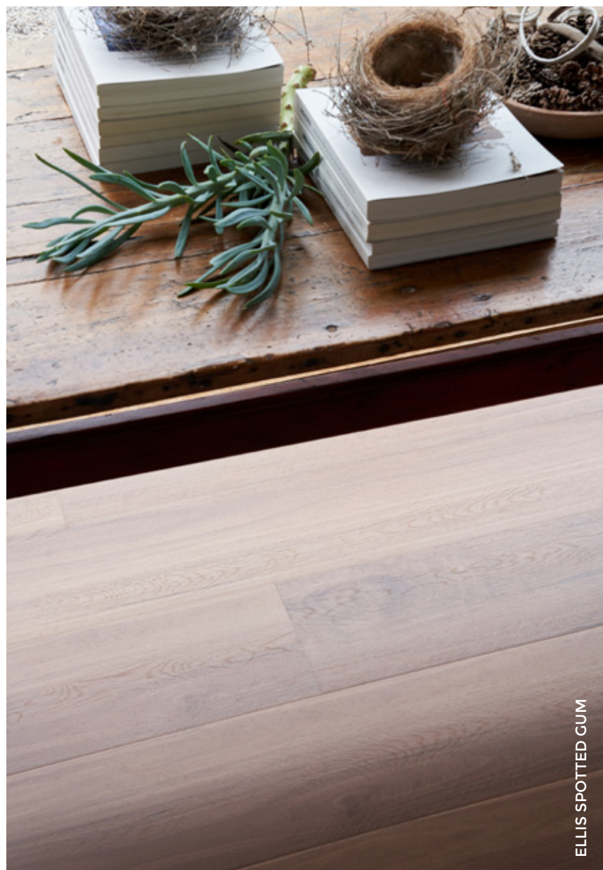
ELLIS SPOTTED GUM

ENJOY MORE TIME SAVOURING THE FLAVORS OF NATURE'S GIFTS, EACH BITE NOURISHING YOUR FAMILY AND REVITALISING YOUR SPIRIT. SPILLS, STAINS, SCRATCHES AND EVEN BURNS ARE NO CAUSE FOR CONCERN WITH PARADISE LAMINATE'S ATROGUARD® SURFACE TREATMENT, PROVIDING YOU A FAR SUPERIOR PROTECTION THAN REGULAR LAMINATE AND KEEPING YOUR FLOORS LOOKING PERFECT FOR LONGER.