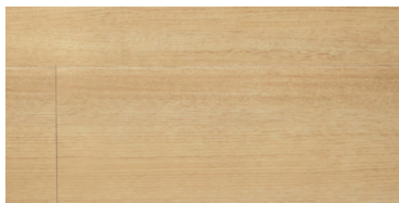
Blonde Tasmanian Oak RET005