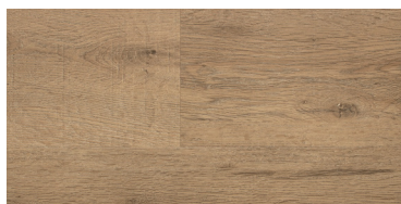
Inger Oak RET009