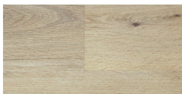
Tarill Oak RET003