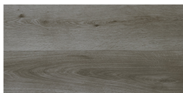
Nambung Oak RET001