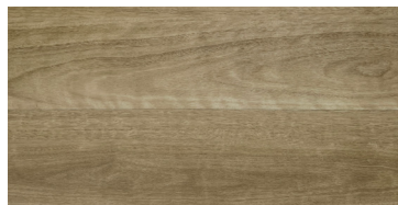
Mirima Spotted Gum RET007