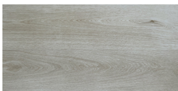
Dorrigo Oak RET002