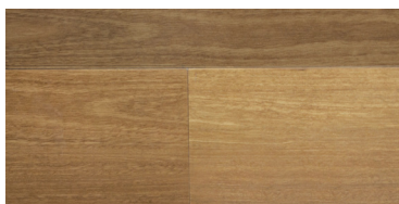
Yengo Spotted Gum RET010 *WOODMIX