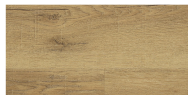
Avar Oak RET004