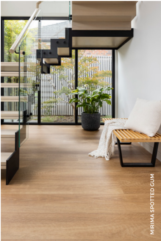
MIRIMA SPOTTED GUM

OFFERING SUPERIOR HEAT AND FADE RESISTANCE, RETREAT HYBRID FLOORING IS DESIGNED FOR AUSTRALIAN SUMMER LIVING, SO YOU CAN WELCOME IN SUNSHINE, WET TOGS AND PETS. LIVE LIFE TO THE FULL ON THE PERFECT FAMILY FLOOR.