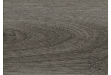
Tarkine Oak ABODERG4874