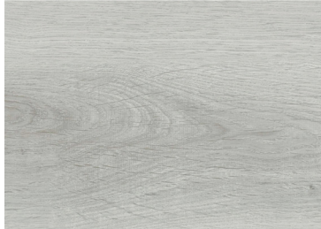
Waverley Oak ABODERG4876