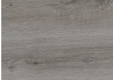
Tongrass Oak ABODERG4873