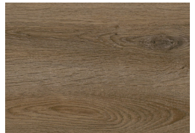
Kingleake Oak ABODERG4871