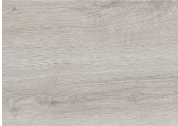
Caldwell Oak ABODERG48719