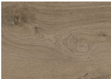
Wandella Oak ABODERG48712