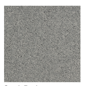
South Rocks TAUPOBAY110