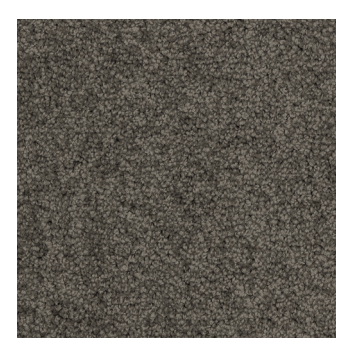
Rock Fall TAUPOBAY060