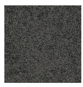
Harora Rock TAUPOBAY070