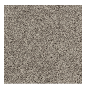
High Tide TAUPOBAY050