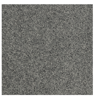
West Bay TAUPOBAY100