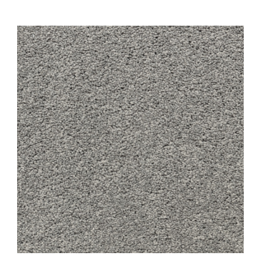
North Bluff TAUPOBAY120