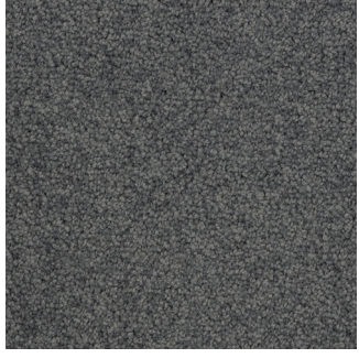
Morlin Drive TAUPOBAY090