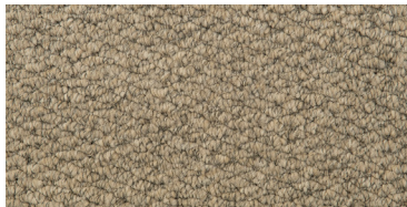
Golden Bay 06