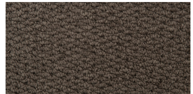
Garden Bay 04