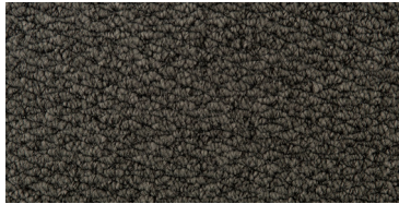
House Bay 01