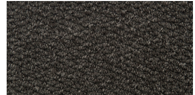
Home Bay 02