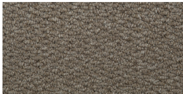
Woody Bay 03