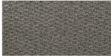
Three Sisters 08