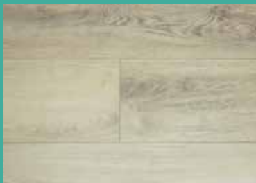
Dawson Oak NOOSA1270