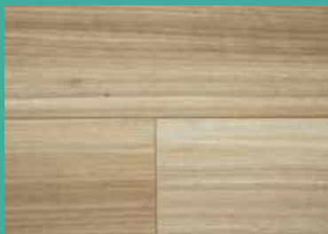
Barwon Blackbutt NOOSA1096