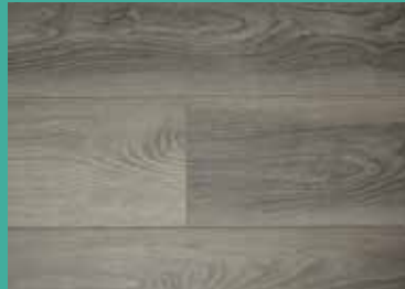
Tarlo Oak NOOSA1273