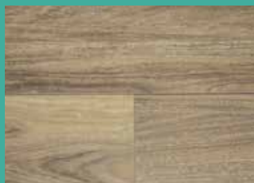
Eyre Spotted Gum NOOSA1320