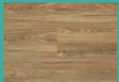
Kindra Spotted Gum NOOSA318