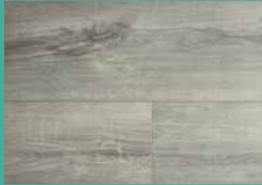
Maroo Oak NOOSA1271