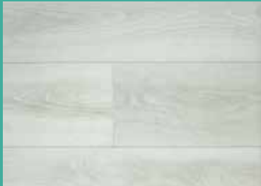
Birrie Oak NOOSA1274