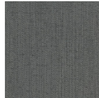
FABRIC dash 2653