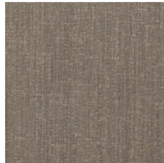
FABRIC flex 2444