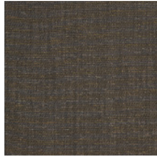
FABRIC map 2741