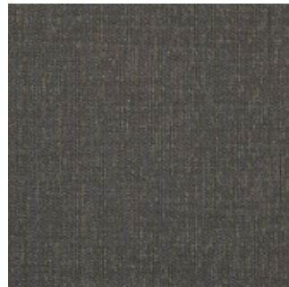
FABRIC formulate 2535