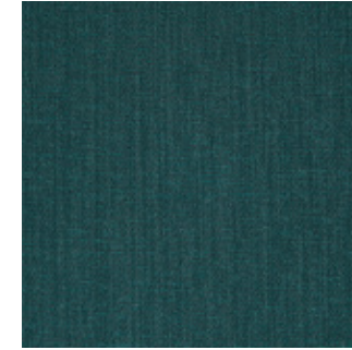
FABRIC enrich 1257