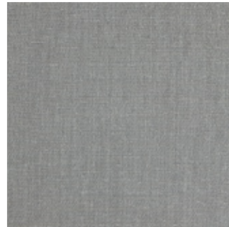
FABRIC purpose 2695