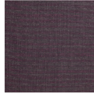
FABRIC touch 1260