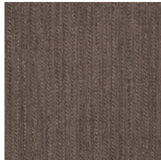
FABRIC create 2646