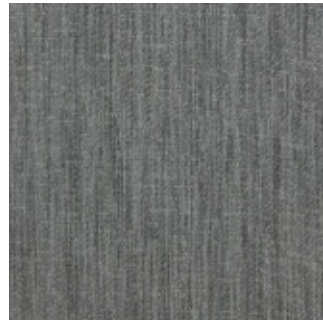
FABRIC motion 4213