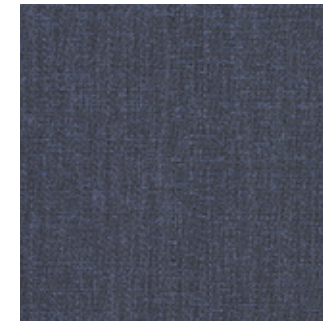
FABRIC flow 1263