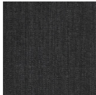
FABRIC dimension 2622