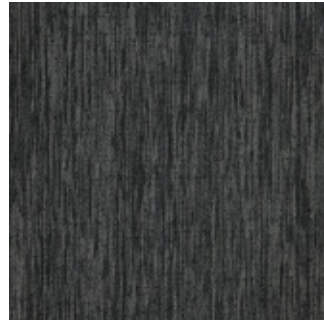
FABRIC arrange 2727