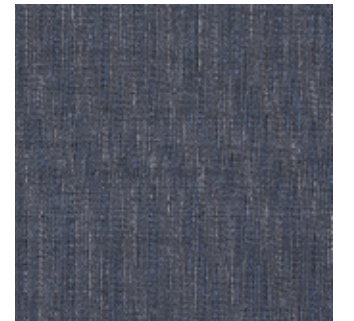
FABRIC compose 1262