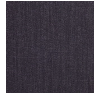
FABRIC current 1255