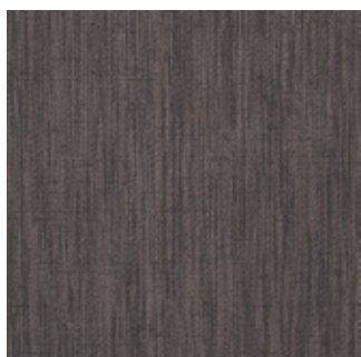
FABRIC scheme 5215