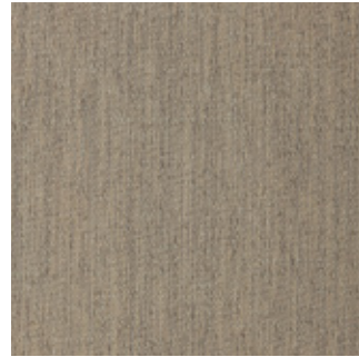
FABRIC breathe 2685