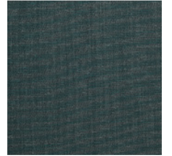
FABRIC evolve 1256