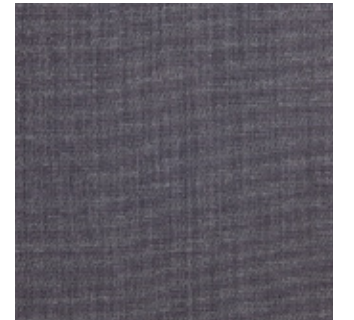
FABRIC circulate 1254