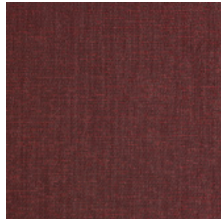
FABRIC pulse 1259