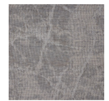
FABRIC marble emperador 1275