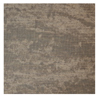
FABRIC desert gobi 1266