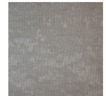
FABRIC desert farafra 1265