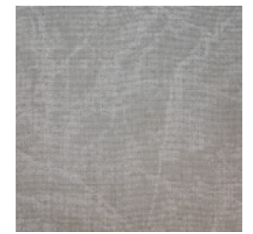
FABRIC marble carrara 1271