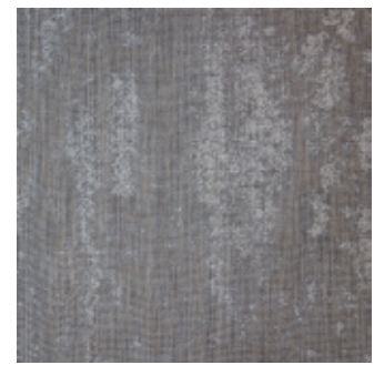
FABRIC desert namib 1269