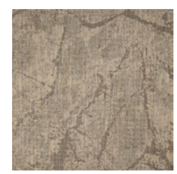
FABRIC marble triana 1274