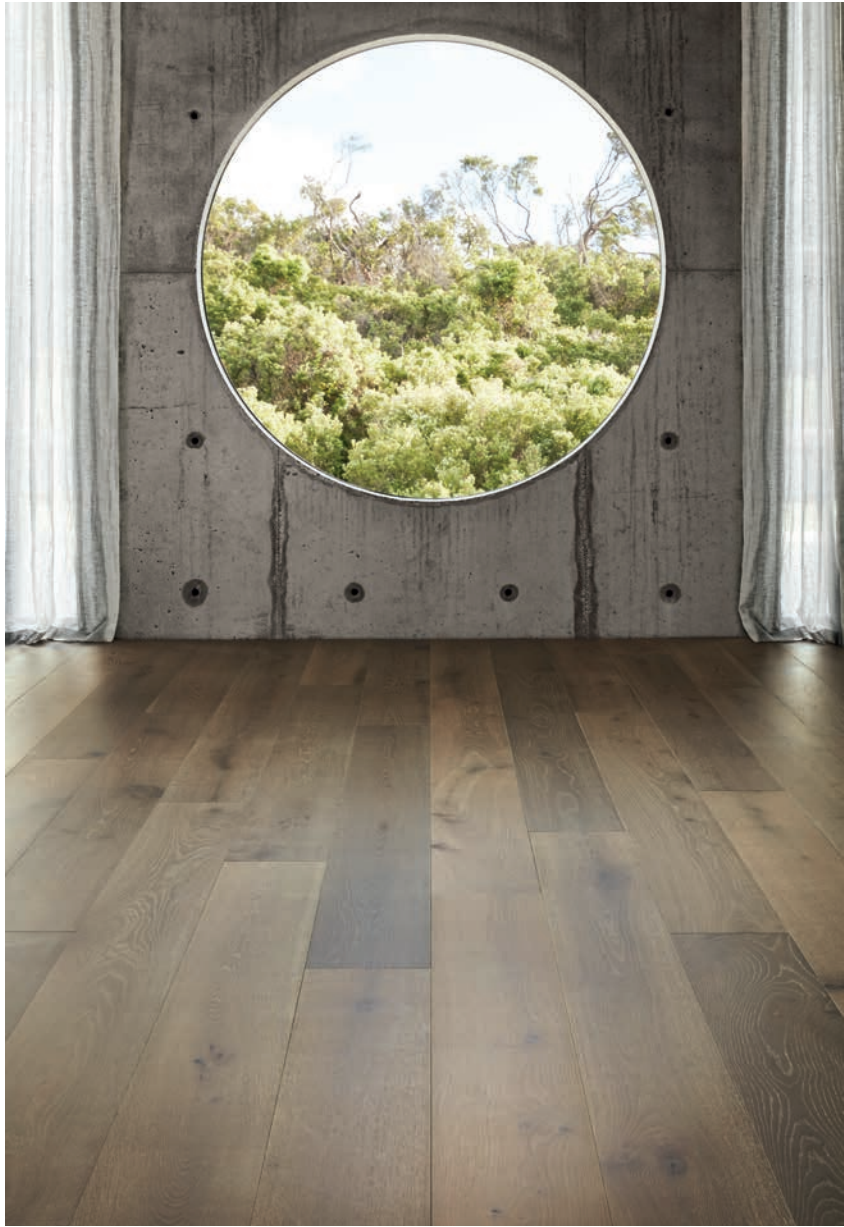
07 Tobacco oak wood