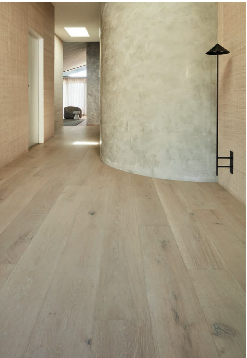
02 Smoke oak wood