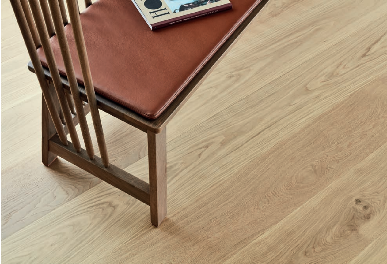
05 Dune oak wood