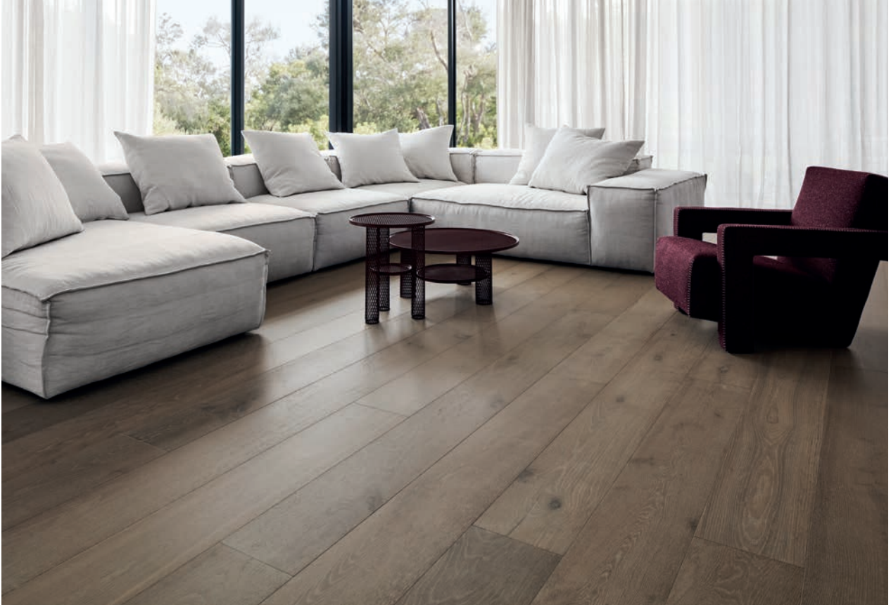
12 Truffe oak wood