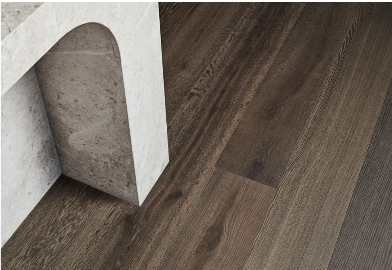
13 Clove oak wood