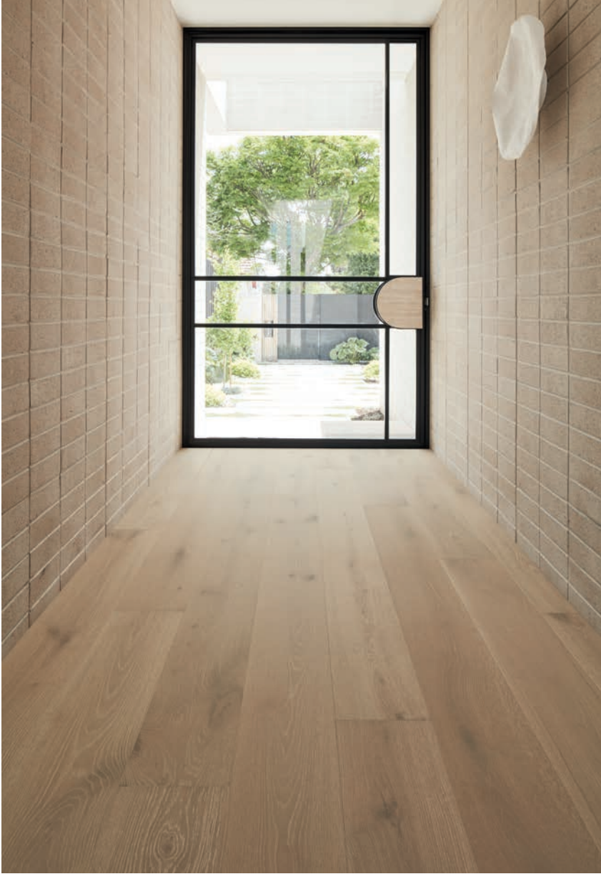
04 Caviar oak wood