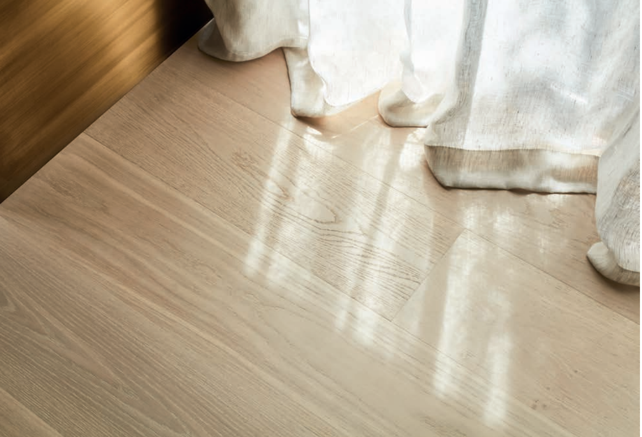
03 Musk oak wood