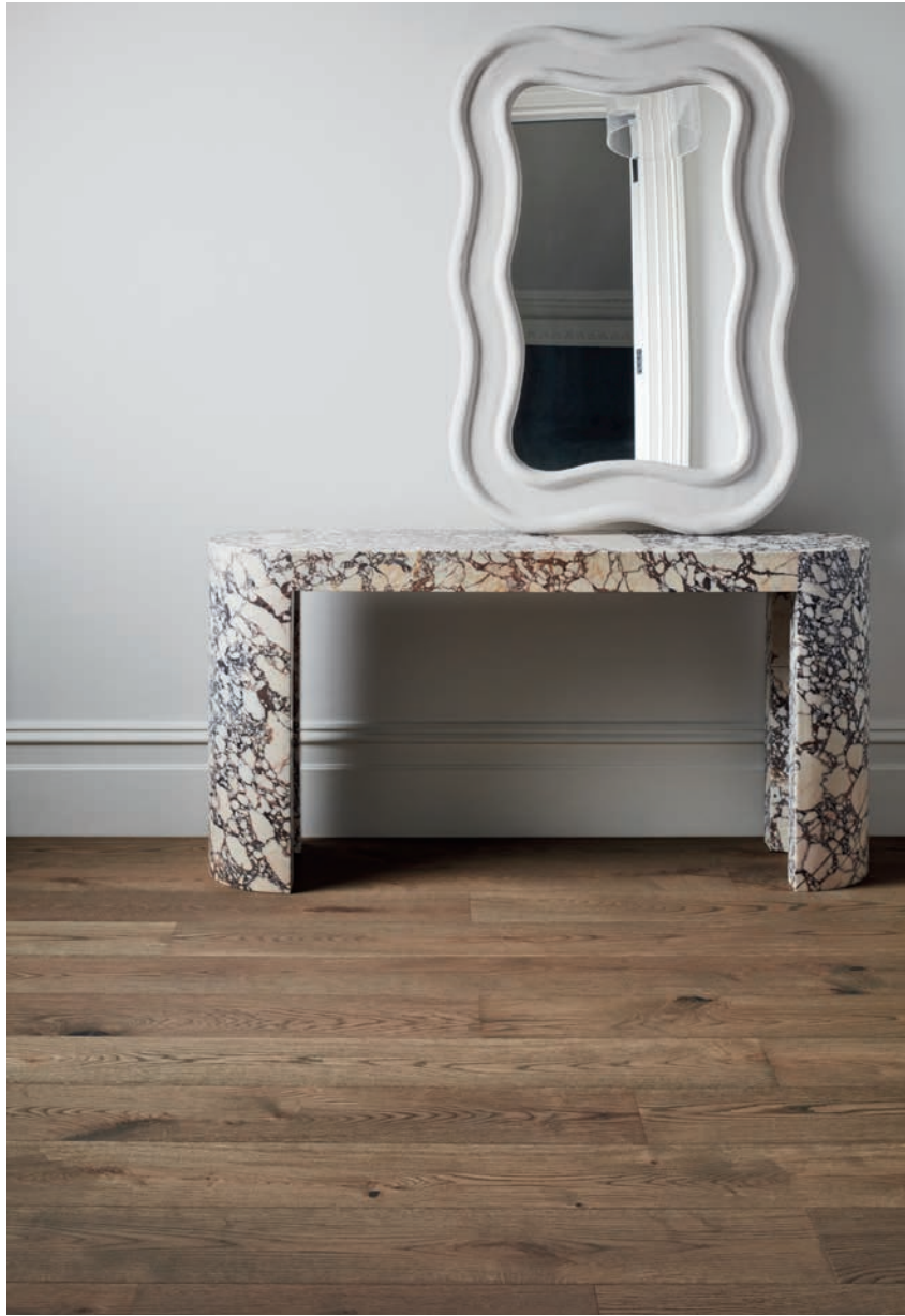
08 Cigar oak wood