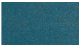
MOSS aqua 3193