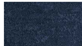
MOSS whale 7112