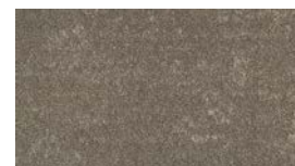
MOSS tan 0507

product construction yarn/fibre pile weight pile height gauge plank size total thickness carton size total weight dimensional stability backing electrostatic propensity