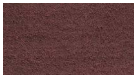
MOSS wine 8561