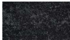
MOSS henna 1675