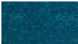
MOSS teal 2131