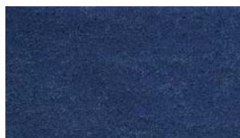
MOSS sea 3936