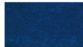
MOSS blue 3704