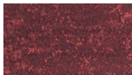
MOSS maroon 2359