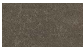
MOSS caramel 0905