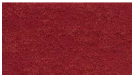
MOSS red 3586