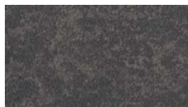
MOSS wolf 0098