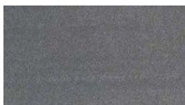
MOSS goose 9897