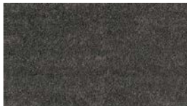
MOSS smokey 7578