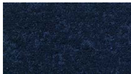
MOSS navy 6740