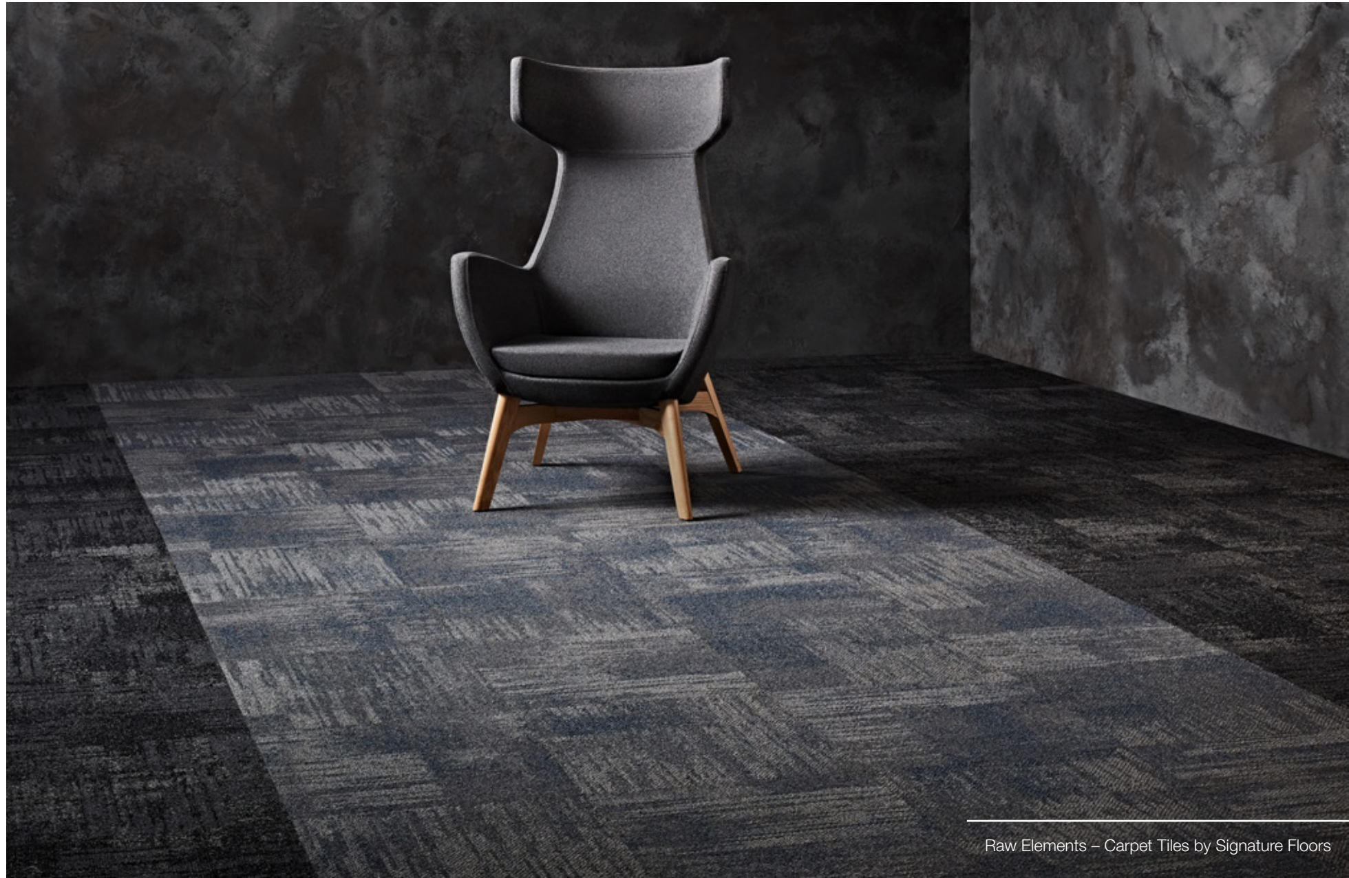
Raw Elements – Carpet Tiles by Signature Floors