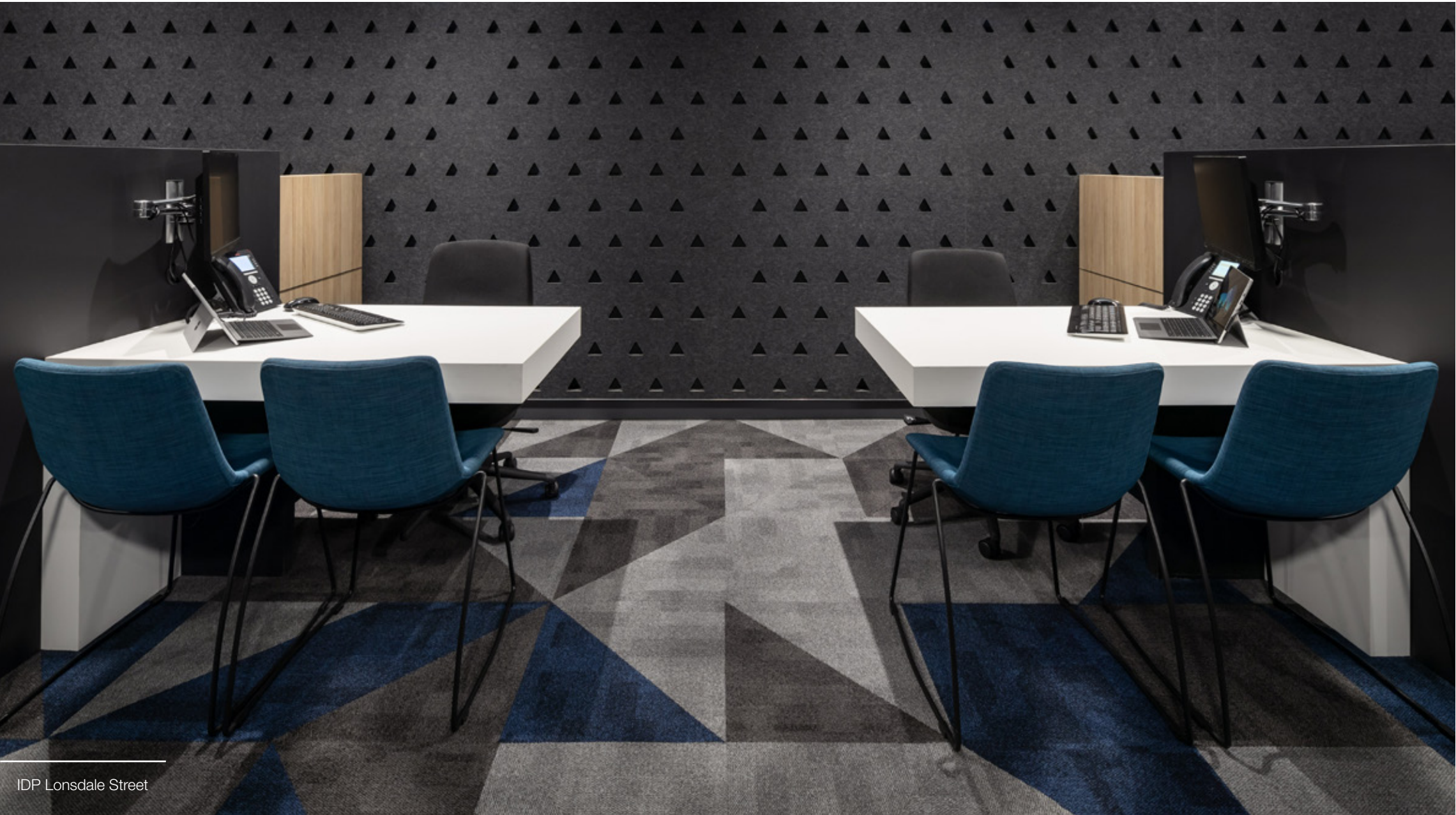
IDP Lonsdale Street