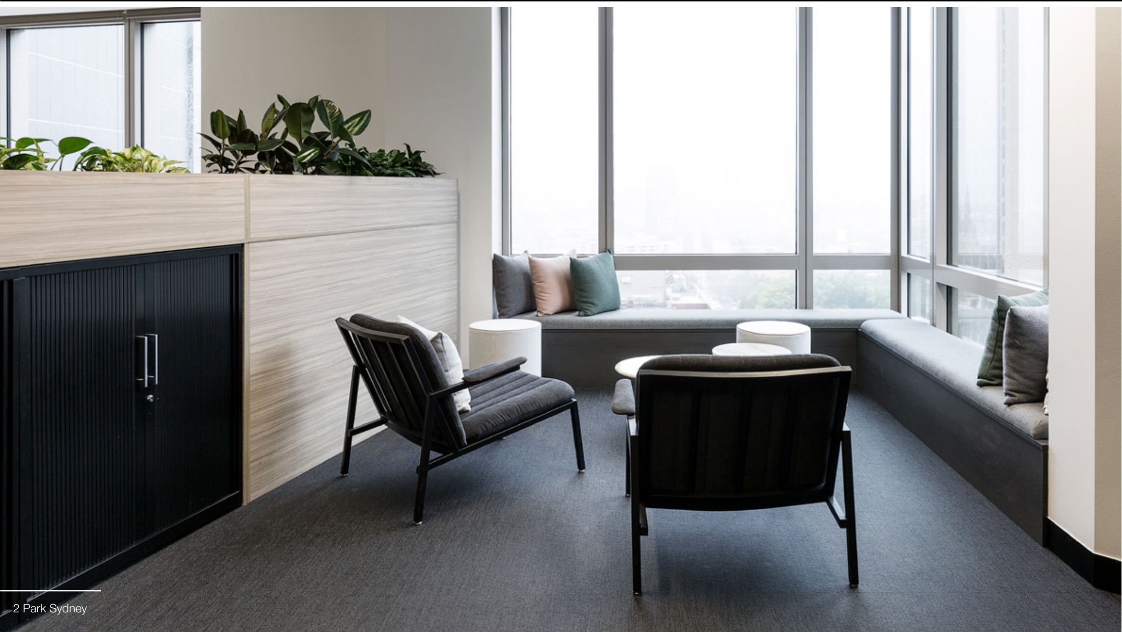
2 Park Sydney

Designer/Architect: Intermain