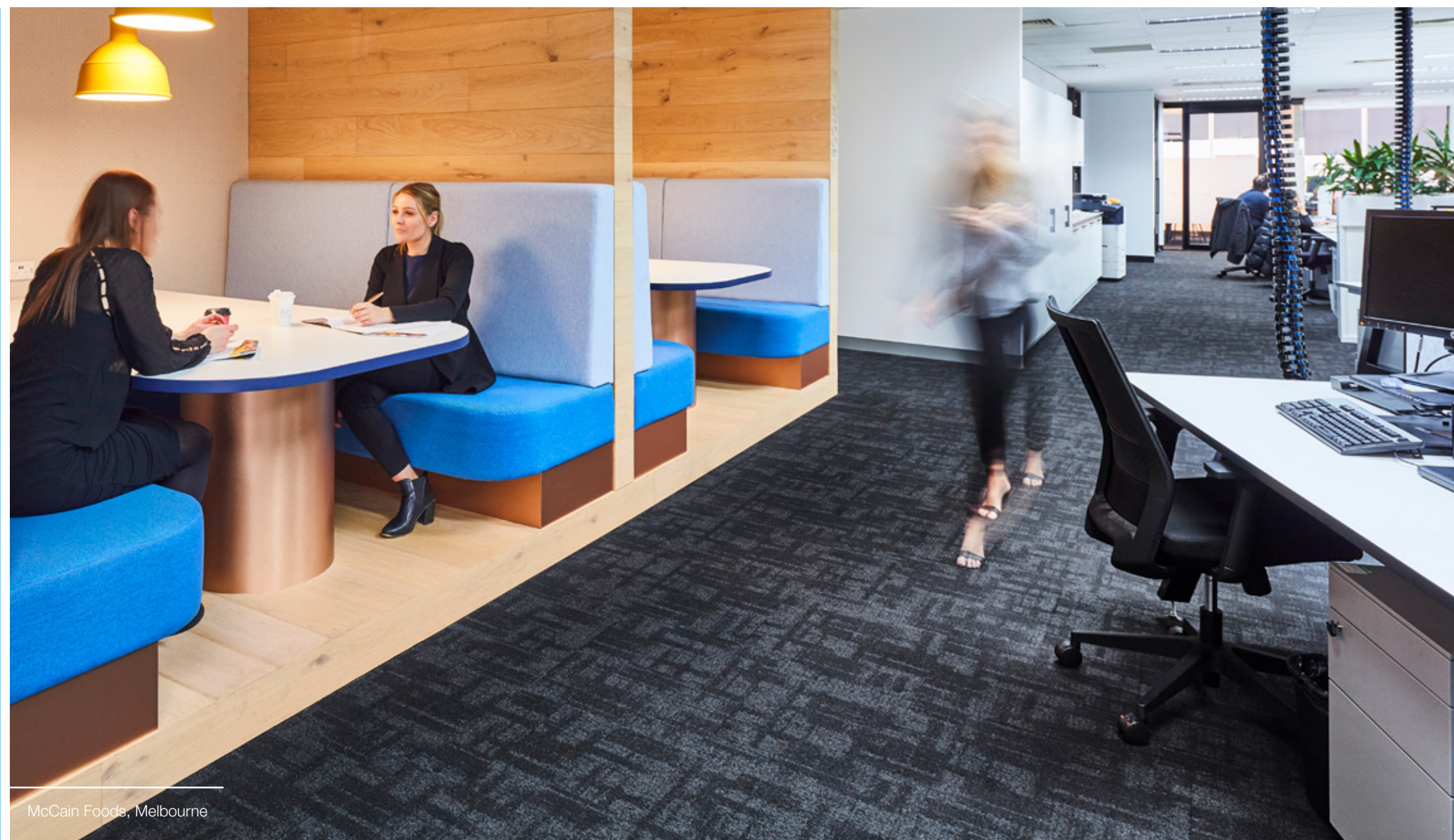
McCain Foods, Melbourne

Commercial warranty is available on all our flooring products.